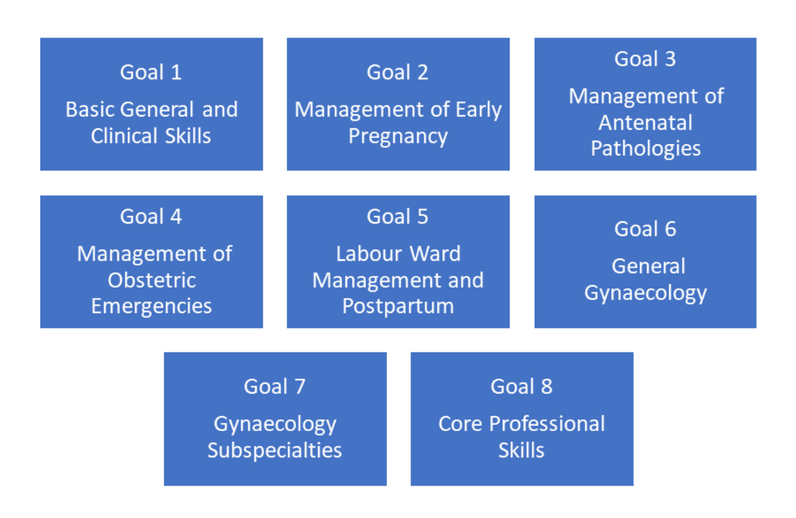
Figure 1 Outline of goals associated with BST Obstetrics and Gynaecology curriculum

The curriculum is divided into eight goals (overarching domains of practice) as shown in Figure 1